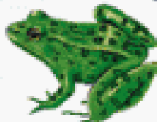
Northern Leopard Frog